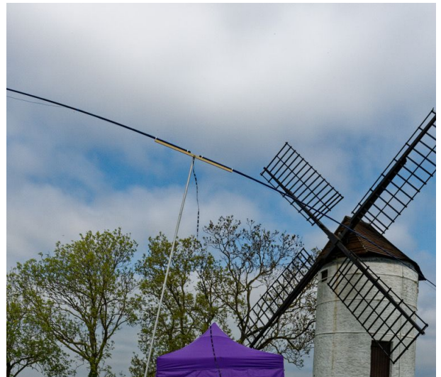
The Spinning Jenny Antenna Leaning over in the wind

This brings us happily to the Bitton Railways 1940 weekend. Although visitor numbers were down for the railway, I think this was purely down to the Fab' British Summertime weather, it did rain both days on and off. But those members of the pubic that did attend appeared to be having a blast. Over the weekend the team managed to work 92 stations.