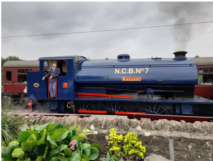
One of the locos making all the noise over our special event contacts on GB0AVR

We have been meeting at our new venue for a few months now and are settling in well.