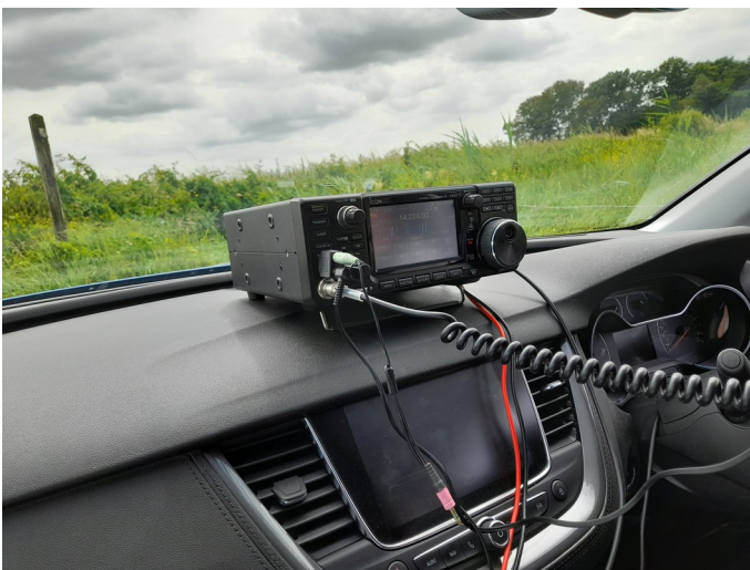
Mat's IC7300 running at 50w through a 20m whip on a mag mount stuck to his roof

Mat and I worked dual operator, that would give the hunter more points and it enabled me to complete my activation of 10 stations. You can see that all of these rules have been well thought out.